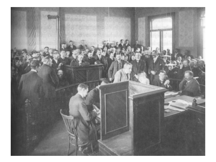
Bill Miner on Trial, Kamloops, 1906