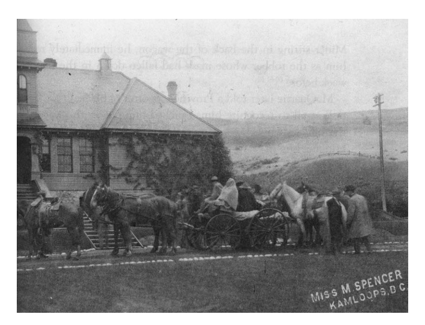
The captured Bill Miner and gang arriving at Kamloops Gaol