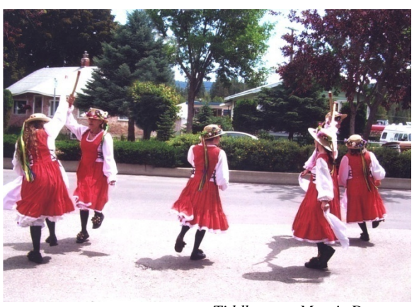
Tiddleycove Morris Dancers

It would become a custom at the Princeton festival to have one or more groups of Morris dancers adding colour and the sound of traditional English dance music at intervals throughout the day. Not listed in the program as performing on stage, but to be found nearby dancing in the street at different times on the last day of June were some of the Vancouver Morris Men as well as the (female) Tiddleycove Morris Dancers.