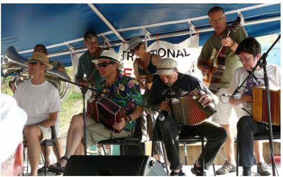
Rattlebone Band and friends

guests from Vancouver and elsewhere on the lower mainland.